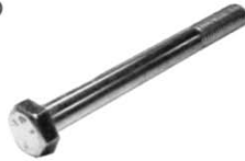
Spindle pin bolt

For gas (4 cycle) ST350 1996-up OEM #01040-G01