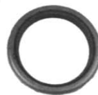
King pin and spindle pin seal

For G&E 1980-94 pre Medalist OEM #16626-G1