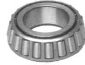
Wheel bearing cone

For G&E all years OEM #50892-G1 / #L-44643