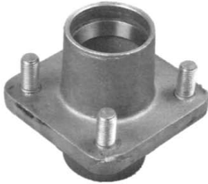
Front hub with bearing races