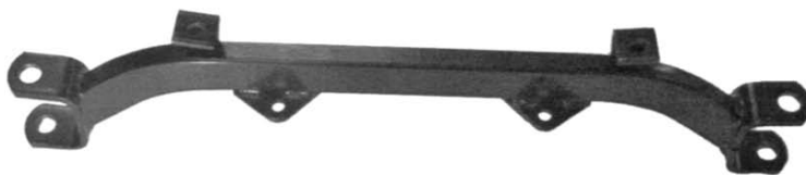
Drop front axle weldment standard for ST350 or use to lift Medalist or TXT

For gas (4 cycle) ST350 1996-up OEM #70515-G01