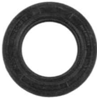
Wheel grease seal