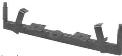
Four wheel front axle weldment