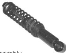
3 wheel front shock and spring assembly