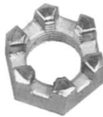
Front hub and spindle nut