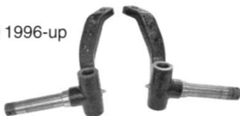
Spindles for ST350