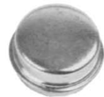
Front hub dust cover