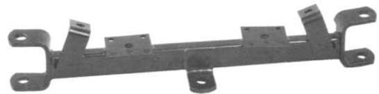
Four wheel front axle weldment

For G&E 1989-94 pre Medalist OEM #23918-G2