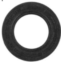
Wheel grease seal