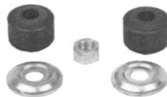
Shock bushing kit