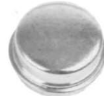
Front hub dust cover