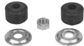
Shock bushing kit