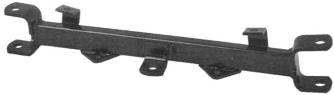
Four wheel front axle weldment

For G&E 1994-98-1/2 (weldment only) with spring plates 1994-00 OEM #70001-G01 (weldment only) OEM #70539-G01 (weldment & spring plates)