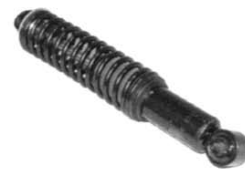
3 wheel front shock and spring assembly