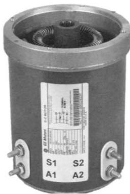
Fleet speed G.E. motor 36-volt w/19 spline coupling

For electric 1988-up Not for DCS or PDS cars OEM #27045-G02