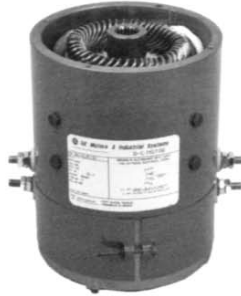
High speed G.E. motor 36-volt / w/19 spline coupling

For electric 1988-up Not for DCS or PDS cars OEM #73124-G05