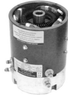
High speed motor for DSC cars

For electric 1996-00 DCS ONLY cars This motor not available from OEM