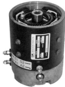
High speed Advanced D.C. motor 36-volt w/19 spline coupling

For electric 1988-up Not for DCS or PDS cars OEM #73124-G03