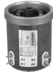
High speed G.E. motor 36-volt w/19 spline coupling

For electric 1988-up Not for DCS or PDS cars OEM #73124-G03