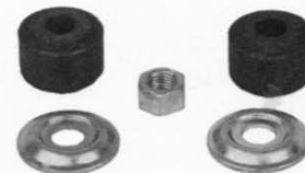
Shock bushing kit