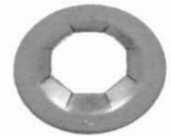
Push nut for hill brake pedal pin