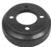
Rear brake drum

4263 For G&E 1981-up OEM #1011137, 1017911-01 For 1995-up use a #1012186 to seal brake drum