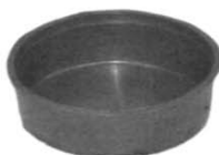
Brake drum seal

1688 20/Pkg For G&E 1974-up OEM #1010984