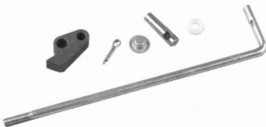
Hill brake rod & pawl kit