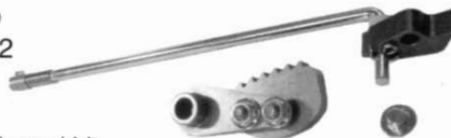
Hill brake rod and pawl kit