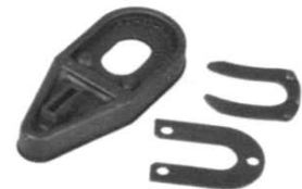
Wheel cylinder mounting kit