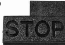
Brake pedal pad