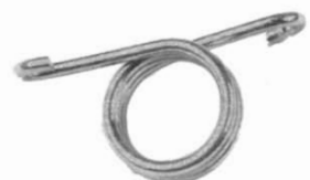
Hill brake spring