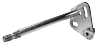
Accelerator pivot rod