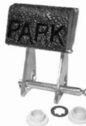
Hill brake pedal kit