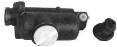
Mercury master cylinder