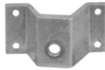
Accelerator bearing & bracket