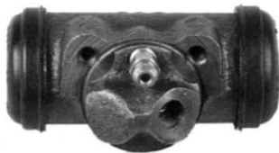
Passengers side Mercury wheel cylinder