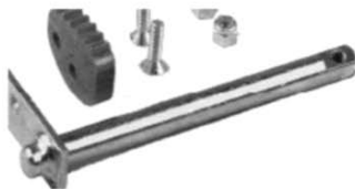
Accelerator pivot rod sub-assembly