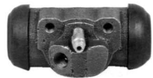
Drivers side Mercury wheel cylinder

4230 2/Pkg For electric pre 1974 OEM #7352