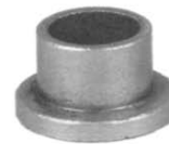
Accelerator pivot rod bushing