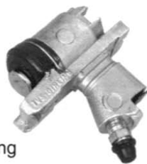
Wheel cylinder for Lucas Girling hydraulic brake system