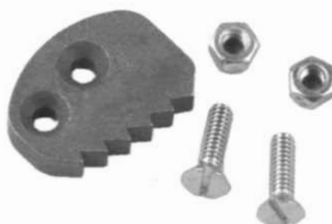
Hill brake latch kit